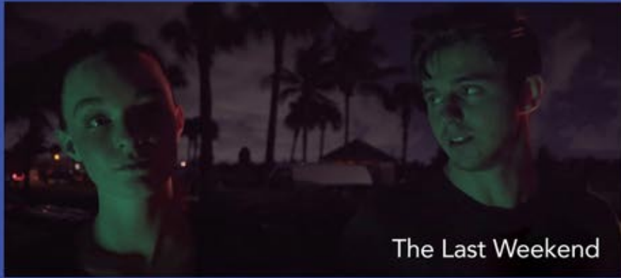
The Last Weekend